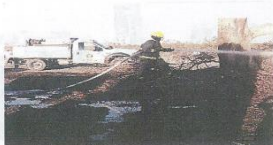
Pic 4 taken on May 6, 2021 Who? _____

Starting July 10 th we will be open on Saturdays from 10 a.m. to 6 p.m. Mon, Fri, & Sat 10 a.m. to 6 p.m. Tue, Wed, & Thurs 9 a.m. to 5 p.m.