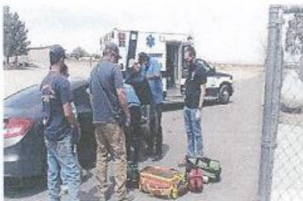
Pic 3 taken on April 24, 2021 Who? _____