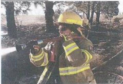
Pic 2 taken on May 6, 2021 Who? _____