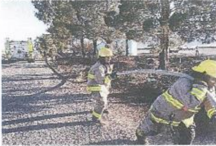
Pic 1 taken on May 6, 2021 Who? _____

Can you guess the names of our Heroes? Answers on next newsletter.